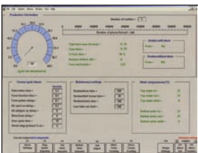
Lookout Control Package