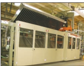
Deep Draw Clamshell