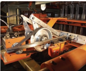
Servo Ejector/ Product Counter