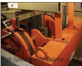
High-Speed Counter Balance